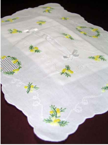
Yellow Floral 30cm X 40cm ( code 16016TT0305 )