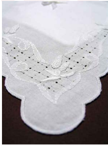
White Maize Corner Design