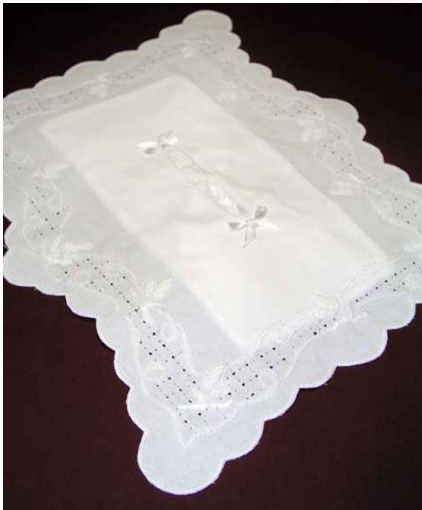
White Maize 30cm X 40cm ( code 16016TT0305 )