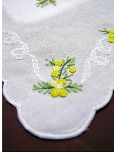
Yellow Floral Corner Design