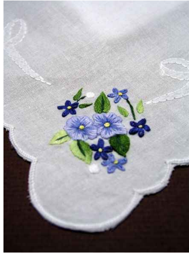
Corner Pattern A