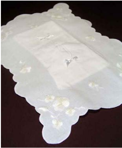
White Orchid 30cm X 40cm ( code 16016TT0305 )