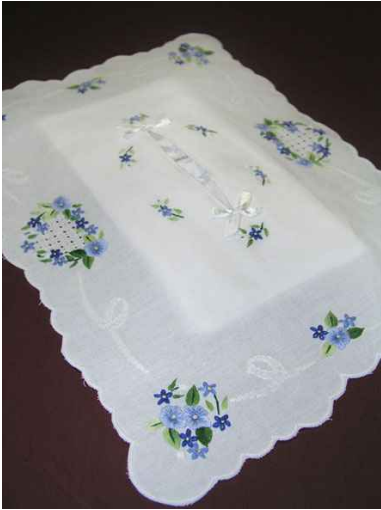
Blue Floral 30cm X 40cm ( code 16016TT0305 )