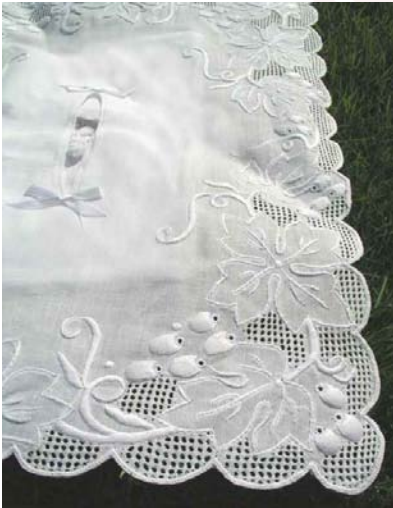
White Grapes 30cm X 40cm ( code 16016TT0305 )