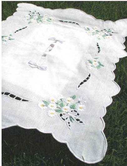
White Daisies 30cm X 40cm ( code 16016TT0305 )