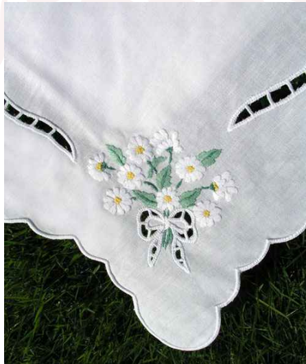
White Daisies Corner Design