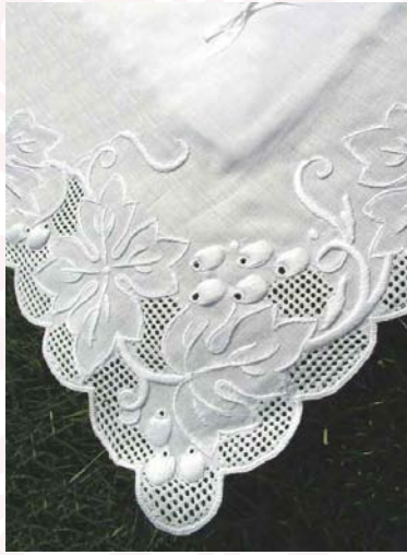
White Grapes Corner Design