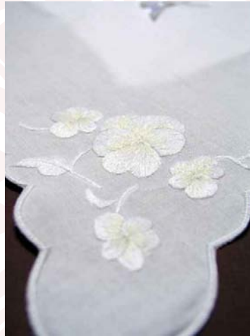
White Orchid Corner Design